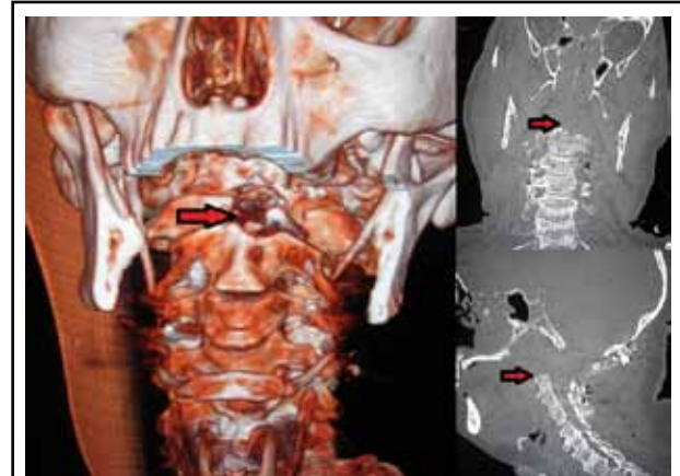
Figure 3. Post-operative CT scan showing absence of odontoid (red arrows) and improved alignment of cervical spine.

Follow-up: On one week follow up, the patient had no motor deficit and the power in all four of his limbs was 5/5. Further follow up is awaited.