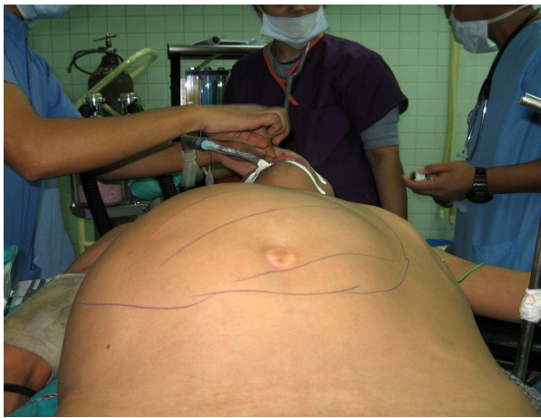
Figure 1. Showing extent of the abdominal lump on examination.

Patient underwent series of various investigations. Routine hematological tests, renal and liver function test were normal. Initially Ultrasound of the abdomen revealed a huge cystic lesion 20x15x15 cm arising from right lobe of the liver with suspicious daughter cyst inside it. So with suspicion of Hydatid cyst, ELISA test for Echinococcus Granulosus Antibody was done and it was positive. So there was strong suspicion of Hydatid cyst of liver. Then, CT scan of the abdomen was planned for detailed evaluation of the cyst. It revealed a unilocular cyst arising from the liver. There was some suspicion of right hydronephrotic kidney. But combining USG abdominal finding, positive serological test and CT abdomen finding working diagnosis of Hydatid cyst involving the right lobe of liver was made and planned for exploration.