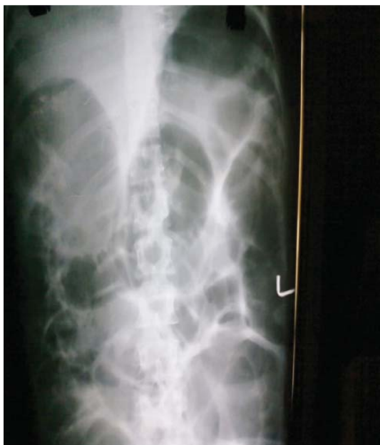
Figure 1: Abdominal radiograph showing a gross dilatation of the large and small bowel with mucosal edema

and had tachycardia. Abdominal examination revealed generalized distension and palpable bowel loops. Liver dullness was not obliterated and bowel sounds were exaggerated. Rectal examination revealed ballooning of the rectum and the non-tender uterus was felt anteriorly, and it was hard in consistency. An abdominal radiograph revealed the grossly dilated large and small bowel with mucosal edema (Figure 1).