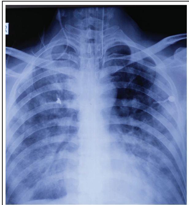
Figure 2. Malposition of the right subclavian vein catheter tip in the ipsilateral right internal jugular vein.

aspiration of blood, the guidewire was threaded freely through the needle without resistance and a 7French triple lumen catheter (Centrifix Trio V720, B Braun, Germany) was passed over the guidewire without any resistance but there was some resistance during withdraw of the guidewire. The catheter was fixed at 12 cm mark after free aspiration of blood from three ports of the catheter and checking the forward and backward flow, but invasive monitoring was not done. A chest X-ray showed a catheter tip at ipsilateral IJV (Figure 2).