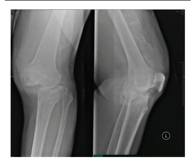
Figure 3-C. Radiographs AP and lateral views of the left knee, 2 months post-arthroscopic washout and antibiotuc therapy, shows some reformation of the medial femoral and tibial condyles.

After blood investigations (Table 1) diagnosis of left knee septic arthritis was made. Intravenous cloxacillin was started. On arthroscopy, both the menisci along with ACL and PCL ligaments were destroyed. The synovium was inflamed. The tibial plateau and both femoral condyles were damaged. Twenty millimeters of haemo-serous fluid was drained, and the joint was washed with saline. The blood, tissue and bone culture showed no growth. The synovial histopathology showed granulation tissue with chronic inflammatory process with no evidence of chronic granuloma or malignancy was seen. The patient completed 2 weeks of intravenous cloxacillin. At two months follow-up, patient was walking with a stick. The radiographs done 2 months post-op (Figure 3-C) showed very little bone reformation.