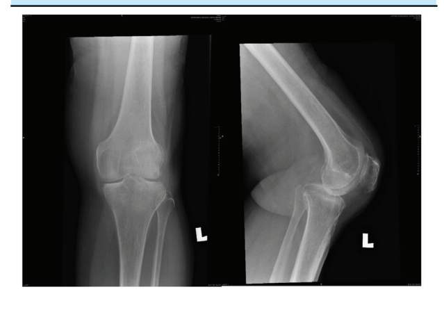
Figure 2-C. Radiographs AP and lateral views of the left knee, 7 months post-arthrotomy and antibiotic therapy, shows some reformation of the medial femoral and tibial condyles.

After blood investigations (Table 1) and aspiration of the knee, diagnosis of septic arthritis was made. Intravenous cloxacillin and gentamicin were started. On arthrotomy of the knee no haemo-purulent fluid was found but the synovium was inflamed. The blood and tissue cultures were sterile. The histopathological examination showed granulation tissue with chronic inflammatory process. No evidence of chronic granuloma or malignancy was seen. Antibiotics were continued for six weeks. At two weeks follow-up, patient was walking with a stick. At 4 months, she was walking using a stick, the left knee was not painful, and she could actively flex from 0 to 120. The radiographs done 7 months post-op (Figure 2-C) showed some reformation of femoral and tibial condyles.