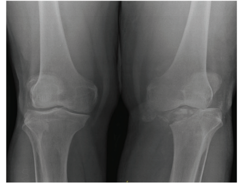
Figure 3-A. Radiographs AP view of both knees, on admission showing marked destruction of medial tibial plateau of the left knee. There is lateral subluxation of the tibia.

A man aged 69, retired salesman of food products, presented with complaints of inability to stand on his left knee for 3 weeks. Three weeks ago, while standing up from sitting position, he felt his left knee could not support his weight. He prevented himself from falling by holding on to the rail. An hour later, he could get up and drove his car back home. Two weeks later he consulted his family doctor who advised for a radiograph of the left knee. About a year ago, he was given intra-articular injection to the left knee by his doctor. He presented to the orthopaedic clinic walking with crutches along with the recent radiograph. He was afebrile and well. The left knee was swollen but did not look inflamed and was not tender. He could actively flex the knee from 0 to 120. He had 10° of hyperextension and 20° each of valgus and varus laxity. Varus-valgus stressing of the left knee did not cause any pain. No distal neurovascular deficit was detected. Radiograph of the knee on admission showed (Figure 3-A) remarkably greater destruction of both femoral and tibial condyle as compared with radiograph done 2 weeks earlier. MRI (Figure 3-B) showed marked destruction of the tibial plateau and of the femoral articular cartilage.