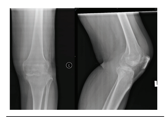
Figure 2-A. Radiographs AP and lateral views of the left knee, on admission show erosion of the medial tibial and femoral condyle with reduced joint space.