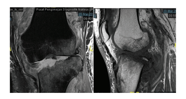
Figure 3-B. MRI scan of the left knee showing marked destruction of the tibial plateau in the coronal view. The sagittal view shows femoral condyle is also involved. Involvement of both distal and proximal surfaces of the joint strongly suggest infective pathology.