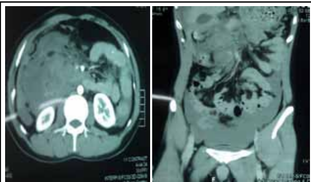
Figure.1 CECT abdomen axial section.

contrast extravasation was seen in pancreatic head region with laceration in uncinate process and head of pancreas associated with periduodenal hematoma with transection of Duodenum at level of D1 and D3/D4 segment (Figure 1 and 2). With diagnosis of Grade V pancreaticoduodenal injury, decision was taken for emergency laparotomy.