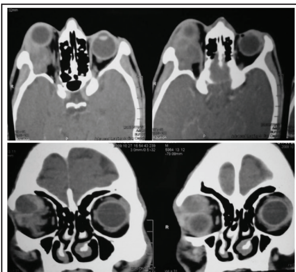
Figure 2. CT axial and coronal section of the brain and orbit showing heterogeneously enhancing attenuated extraconal mass measuring 30.5mmx23.5mm in size in superolateral quadrant of the right orbit with small faint calcification within it. Right lacrimal gland is not seen separated from this mass.

was 1x0.5cm nontender, firm, immobile, irreducible, noncompressible mass in the superotemporal quadrant of the right orbit free from underlying skin anteriorly while posterior extent was unappreciable. Ptosis was mild with good levatorpalpebrae function, probably because of mechanical and aponeurotic components. The sclera and cornea was normal, and the pupils were bilaterally symmetrical and reacting to light. Fundoscopy was normal. Lymphnodes, cranial nerves and systemic examination were normal. The left eye was normal and there was no intracranial focal lesion. CT scan imaging of the head and orbit revealed heterogeneously enhancing soft tissue extraconal mass in the right superolateral quadrant of the orbit most likely mass of lacrimal gland origin (Figure 2).