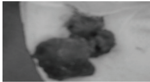
Figure 3. Showing gross well circumscribed, lobulated and solid mass measuring 4x3cm post excision .

Orbit is a bony structure covered on all sides by bony walls except anteriorly. The diseases in the orbit can arise primarily from the orbit itself or secondarily from surrounding regions like paranasal sinuses, eyelids, periorbital area and intracranial compartment.