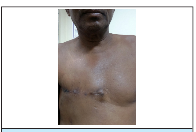
Figure 2. Post-operative picture of the right breast carcinoma on follow up visit.

A 78-year-old man presented with a history of painless swelling in the left breast for 1 month. On general examination there was bi-pedal edema and patient gave history of shortness of breath. Chest x-ray showed cardiomegaly. Echocardiography was done and it was suggestive of right atrium, right ventricle dilatation, hypertrophied right ventricle, mild tricuspid regurgitation, pulmonary arterial hypertension with grade I diastolic dysfunction. On physical examination, a non-tender lump measuring about 3x2 cm was palpated just beneath the left nipple; it was mobile and not adhered to underlying structures. The clinical stage was T2N0M0. Fine needle cytology reported carcinoma of breast. He underwent a right-sided Auchincloss modified mastectomy. Operative findings were lump of size 3*2cm with enlarged axillary lymph nodes at level II and I. Histo-pathological examination showed invasive breast carcinoma, NOS, Grade 2 with NPI score of 8. He received two cycles of postoperative chemotherapy. He was followed for 2 years post surgery, which was uneventful. Post-operative photograph (Figure 2).