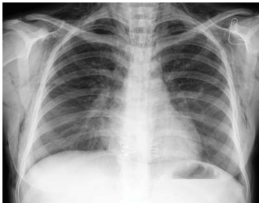
Figure 2. Chest x ray showing subcutaneous emphysema

The patient came walking comfortably to the emergency room and her vital signs were normal. There was swelling over the right side of chest extending through the neck to the right side of the face (Figure 1). The swelling was non-tender, crackling in palpation and without increase in local temperature. On auscultation of the chest, air entry was equal on both sides. Other systemic examinations were normal.