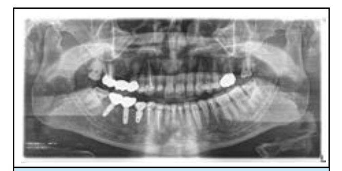
Figure 5c. Postoperative Orthopantomogram.